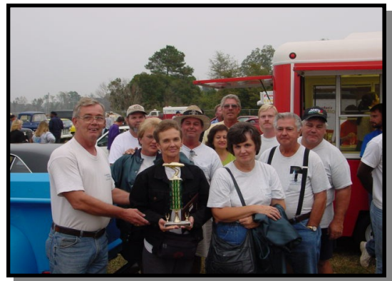
All the winners together