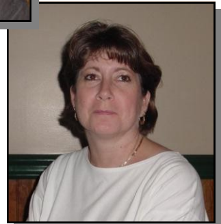
Best known for her spirit and commitment

Next Meeting Saturday - January 12, 2002 6:30 Meeting Mc Alister Restaurant